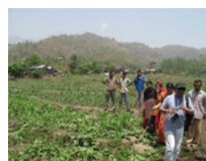
and they are very tasty. Page 3

This program was self initiated by the farmers and gets support from Plan to further develop. We tasted the vegetables like tomatos