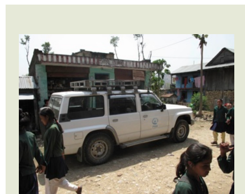
Kids coming from school by passing the Plan International jeep, well known in the villages of the district Magwanpur.

and introduction of Plan Nepal and a briefing for the visit. He invited us to the Program office in the city and we got later further details how Plan is