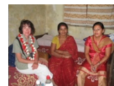
activities are impressive. Page 3

This activity was started 11 years ago just with a view rupies savings per woman. Today's size of their finance