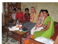
in their home. Page 2