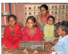
cared. Page 3

In the district Magwanpur alone Plan supports 198 childcare centers. We got some insights how the children get educated and