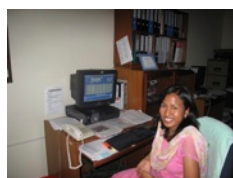
Sponsor exchange works. Page 1

We had the opportunity to see various activities in the Plan Program office in Hetauda. We understand now better how the Child-